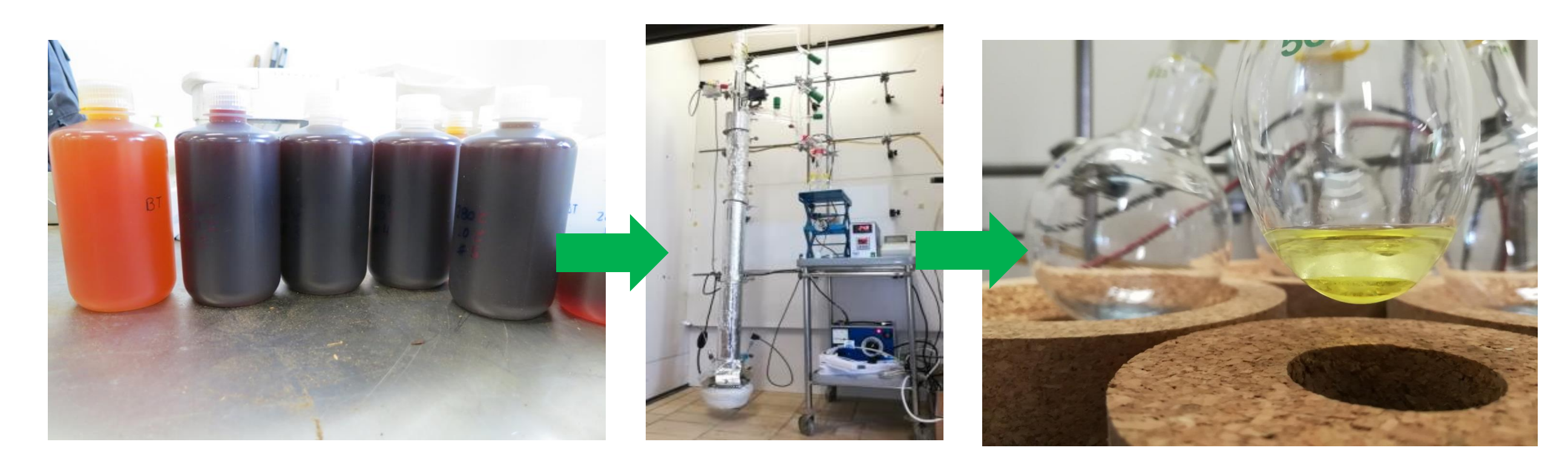
Figure 1. Batch rectification column with initial condensate and obtained furfural fraction.

The obtained condensate was rectificated at up to 200° C using the apparatus shown in Figure 1 equipped with a packed column. Samples were analyzed by GC-TCD.